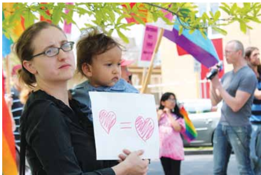
Pro-marriage equality attendees at Saturday's rally in Little Village.